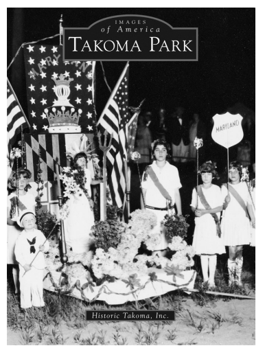
Takoma Park (2011) $21.99 plus tax and shipping online or local merchants

Capturing the artistic and musical flowering as well as the expanding diversity presented a different problem. Most snapshots are too low-resolution to scan, but the Voice photographers helped fill the gaps.