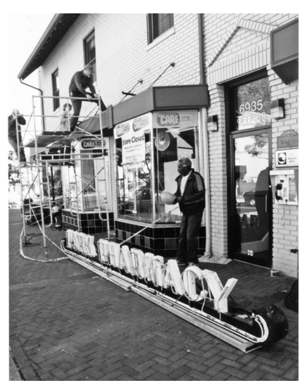
The day Park Pharmacy closed

We invite you to see the results for yourself.