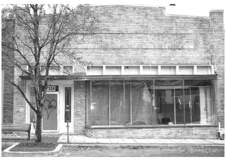
The facade was washed and new glass installed in the bay window of the HTI building.

nyone who has passed by the { m A} Junction in recent weeks has noticed the significant progress made on the facade of HTI's building at 7328 Carroll Avenue. This work has consisted of repair, restoration and cleaning of the building facade with much focus on the prominent bay window. The bay window was in terrible disrepair when HTI took ownership of the building, made possible by matching grants from both the State of Maryland and the Arts and Humanities Council of Montgomery County. New glass, along with copper muntons and