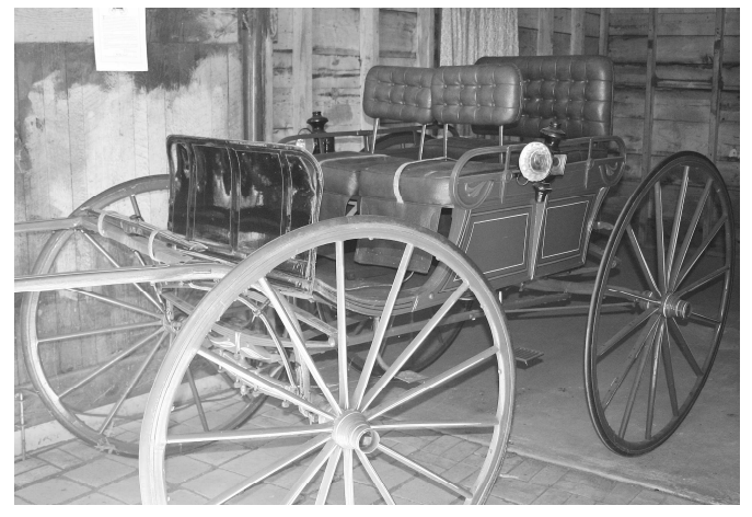
An original nineteenth-century carriage from the Thrasher Carriage Museum in Cumberland, MD, was on display at the Festival.