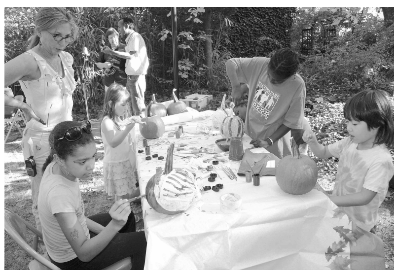
Pumpkin painting was just one of the activities for kids at the HTI Fall Festival.