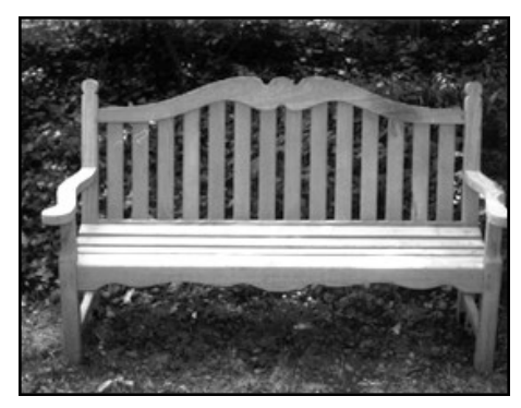
HTI recently bought and installed this handsome bench at the Carriage House.

Visitors to the Carriage House now can enjoy a Victorian-style bench that was recently purchased and installed by Historic Takoma, and paid for by the City of Takoma Park.