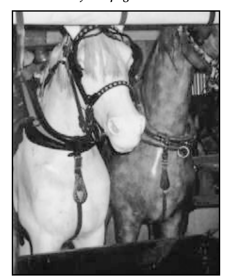
They only look real! The beautiful white horse will accompany the carriage to Takoma Park. He was built originally to display riding equipment.

Horse and Carriage ➤ Continued from page 1