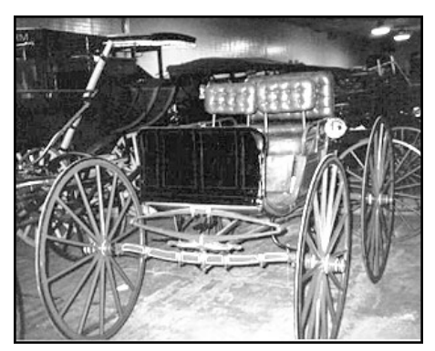
Built around the turn of the century, the Essex Trap was the kind of carriage likely to have been used by the early owners of the Carriage House.

a veritable maze of carriages and other accoutrements until they spotted a perfect carriage for the Thomas-Siegler Museum: the "Essex Trap." It is a small two-seater that would have been used around the turn of the century for short trips such as shopping or weekend outings. The style of the carriage and types of trips it likely would have been used