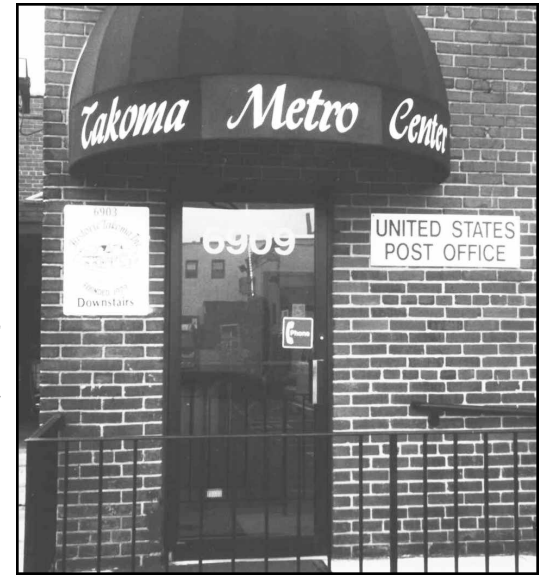
One entrance to the new HTI archives is behind the Old Town Post Office.

During the next year, the planning team >Continued on Page 3