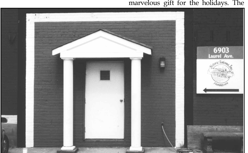
The Eastern Avenue entrance to the new HTI archives.(Official address is on Laurel Avenue.) An additional entrance is next to the back door to the Old Town Post Office.

The wonderful photographs and detailed history of our City make this a marvelous gift for the holidays. The